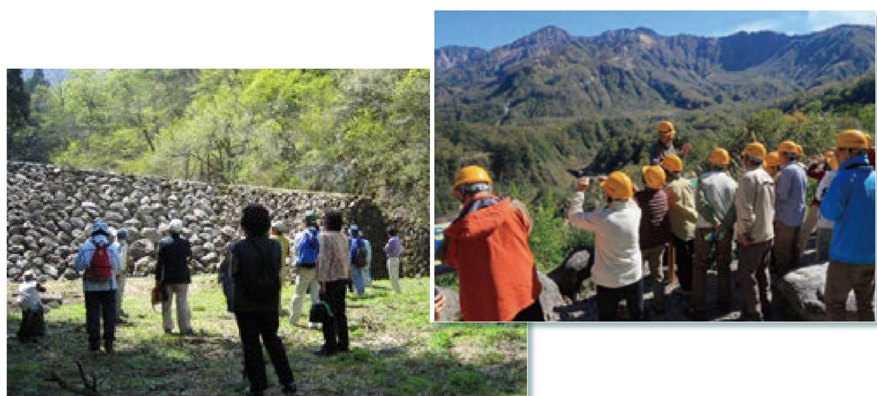
Figure 1: Excursions to sabo facilities