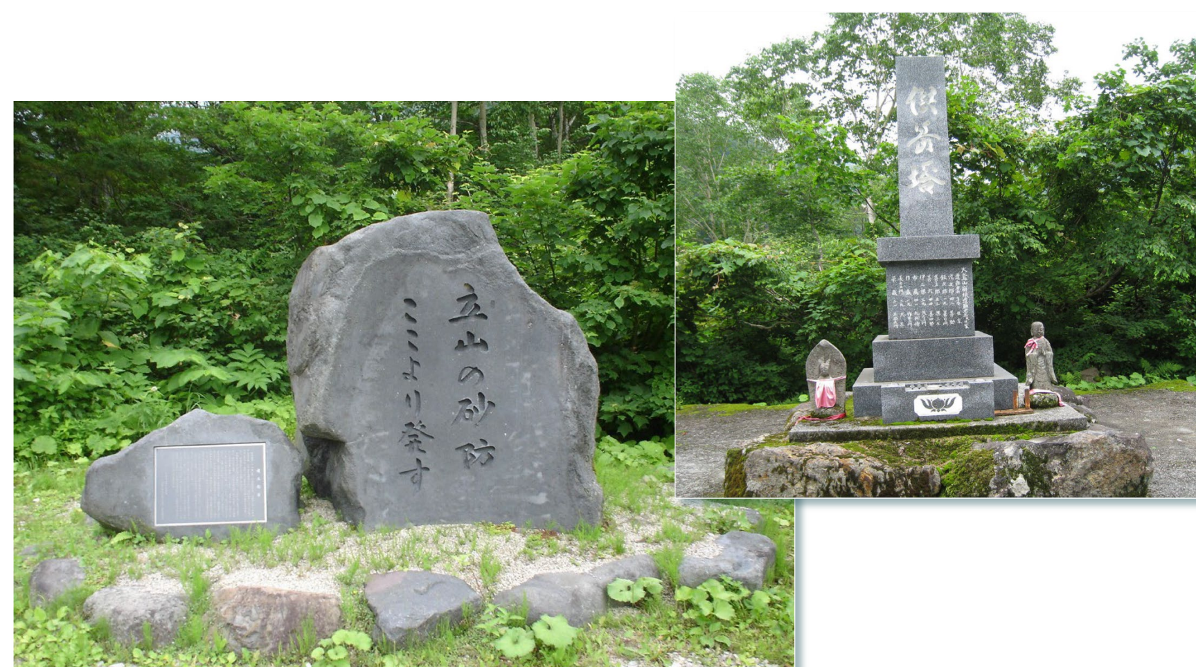
Figure 2: stone monuments