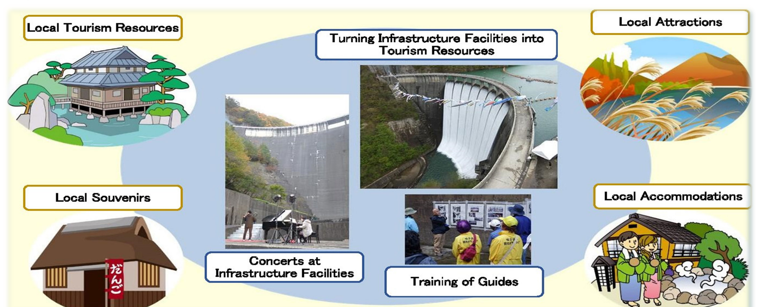
Figure 4: Image of collaboration

In 2016, The Ministry of Land, Infrastructure, Transport, and Tourism launched a portal site introducing infrastructure tourism and are spreading the word about its appeal.